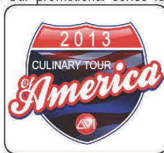
Plate of the State

Pack your bags and hop onboard our culinary road trip. Our promotional series for this upcoming school year will be based upon the fare from different regions of the United States each and every month! Students can enjoy specialty dishes inspired by the native flavors of each area while also learning about each locale. Southern Barbecue in September is an awesome way to rev up for a new school year. Barbecue sauces vary in the South; some are vinegar based while others use ketchup. There are also mustard based barbecue sauces as well as lighter tomato based sauces. Did you know... Lexington, North Carolina is the Barbecue Capital of the World. If you think that sounds interesting and yummy at the same time, wait till you see what we are cooking up in the months following September. Here's a hint... The month of October is a celebration of the Great Lakes Region and in November we are going to be serving Mid Atlantic fare. And what specialty dishes will we be serving??? Guess you will have to wait and find out.